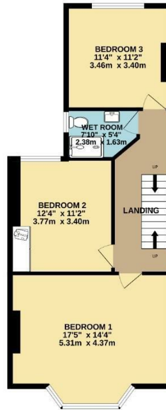
1ST FLOOR 630 sq.ft. (58.5 sq.m.) approx.